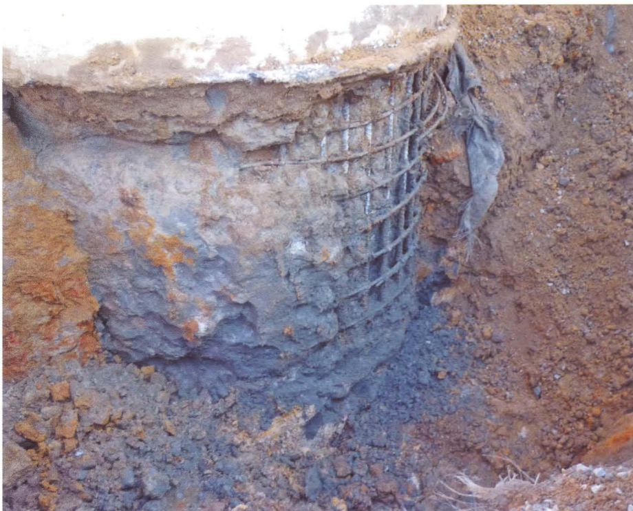
Partially exposed shaft without wheel spacers shows improper concrete coverage.