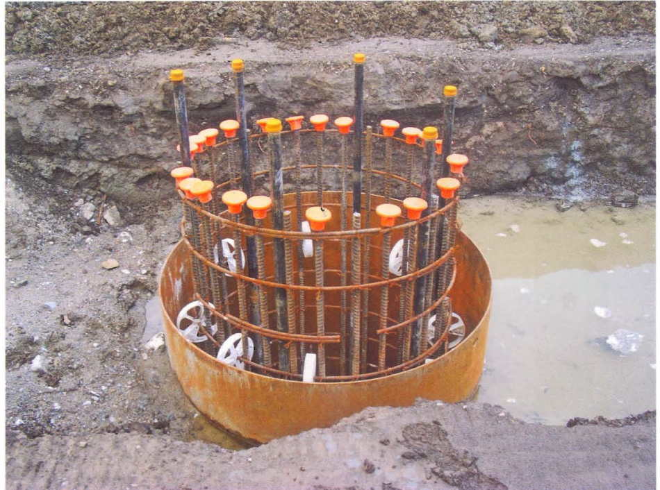
Cased shaft with spacers attached to reinforcing cage.

As drilled shaft construction installations have evolved over the years, two age old problems have been successfully solved. The first relates to design engineers inter-