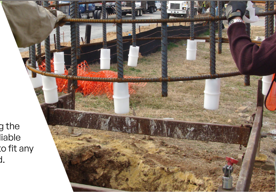
Guiding rebar cage into drilled shaft with Barboots attached

Born on the job site, Foundation Technologies knows the value of having the right tool for every job. Barboot® is a reliable and cost-effective solution, designed to fit any bar size and install easily with one hand.