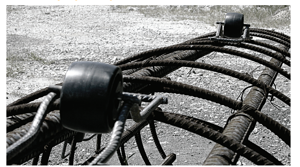
Reinforcement\ cage\ staged\ with\ Cage casters\ attached\ for\ installation\ within\ battered\ shaft