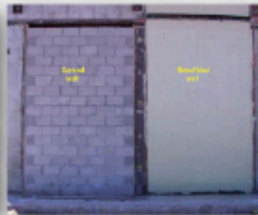
Figure 2. Containment Structure with Control and Retrofitted Walls installed