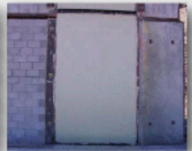
Figure 4. Exterior view of retrofitted wall