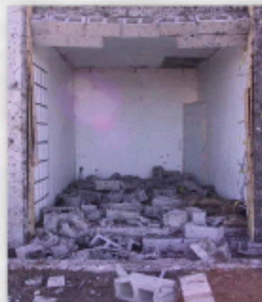
Figure 7. Post-test view of control wall

The detonation of the explosive created a crater that was approximately 108 inches in diameter with a maximum depth of 21 inches. The control wall was completely destroyed. (Figure 7) The retrofitted wall remained intact, and no debris of any kind was found in the interior space behind the retrofitted wall. (Figure 8) The maximum pressure exerted on the exterior face of each wall was 178 psi; the sensor located in the interior space behind the retrofitted wall recorded a peak pressure of 1.46 psi (overburden), demonstrating that nearly all of the force was dissipated by the BlastSeal™ System.