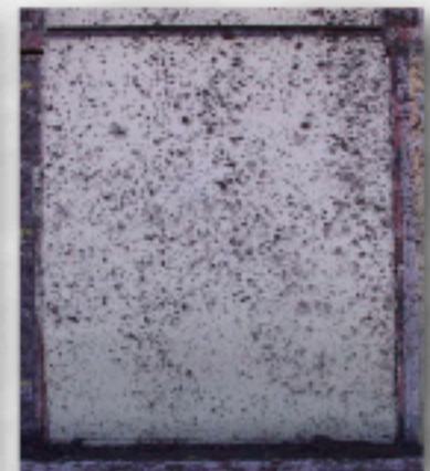
Figure 8. Post-test view of retrofitted wall