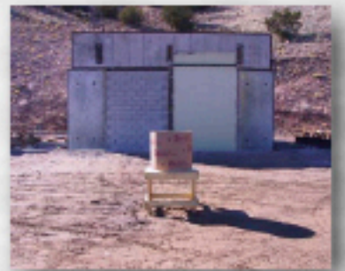
Figure 5. Exterior view of test structure and explosive