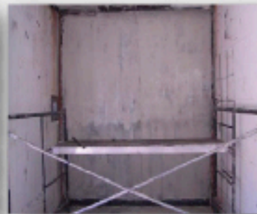
Figure 3. Interior view of retrofitted wall