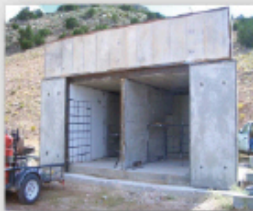
Figure 1. Containment Structure before installation of CMU walls

HJ3 conducted testing to demonstrate the performance of the HJ3 BlastSeal™ System (formerly Blastek™) in a live-action setting. To conduct the test, two un-reinforced concrete masonry walls were constructed within a larger containment structure, with each wall being 8 feet wide by 11 feet tall. One wall was used as a control specimen and the other was retrofitted with the BlastSeal System. (Figures 1 & 2)